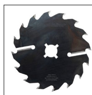
Circular Blade 225 mm Order No. TMB225.016.35